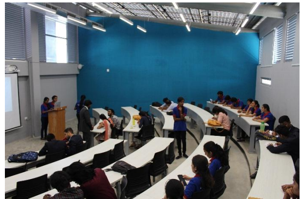
(Participants participating at the events)

We had enthusiastic student participants from multiple colleges, to name a few - Sheshadripuram Institute of Commerce & Management, Bharatiya Vidya Bhavan, SJBIT, East Point College, South East Asian College, Adarsh Institute of Management among others. The students participated actively in all the events by displaying captivating performance that triggered the energy levels of audience as well as the participants amongst themselves.