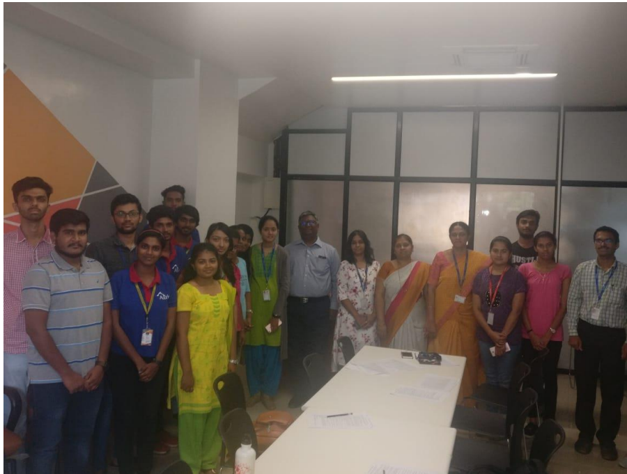
(Student Participants with faculty and external Resource persons)

The objective of the SEDP was to instill an entrepreneurial awareness among the student community. The SEDP was free and open to students from all branches of the Institute.