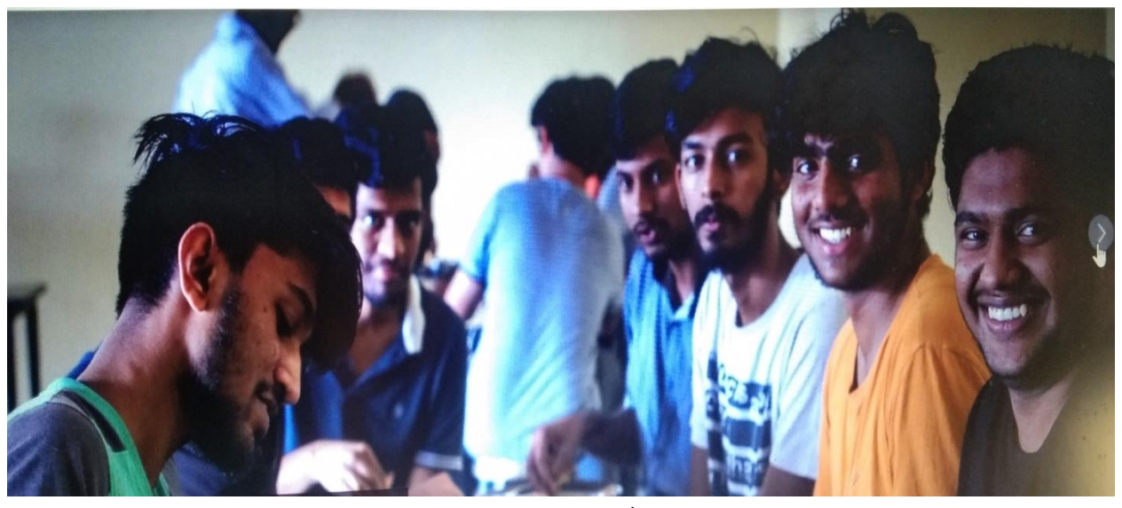
Hostel students at Mess / dining area