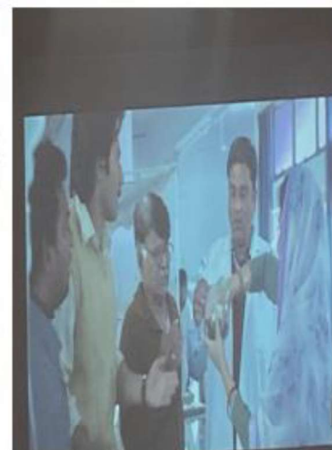
'Sui Dhaaga' Movie Screened on 20.05.22