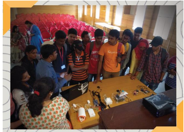
Workshop on Web Designing