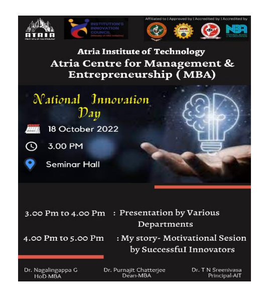
Motivational Talk on Innovation Day - 18.10.22

Innovation is a key to the success of any nation and there is a need to cultivate the idea of innovation among the students. This program was organized to give an insight about innovation in the fields of engineering and management. The main aim of the program was to create awareness about the importance of creativity and innovation in all aspects of human development.