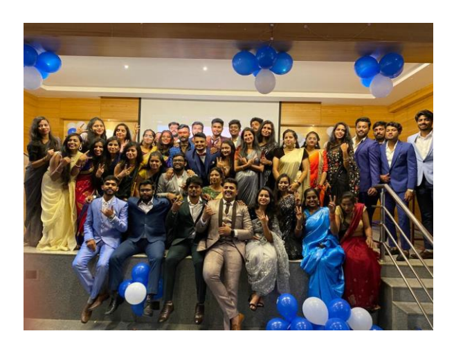
(Students at their Farewell Party)