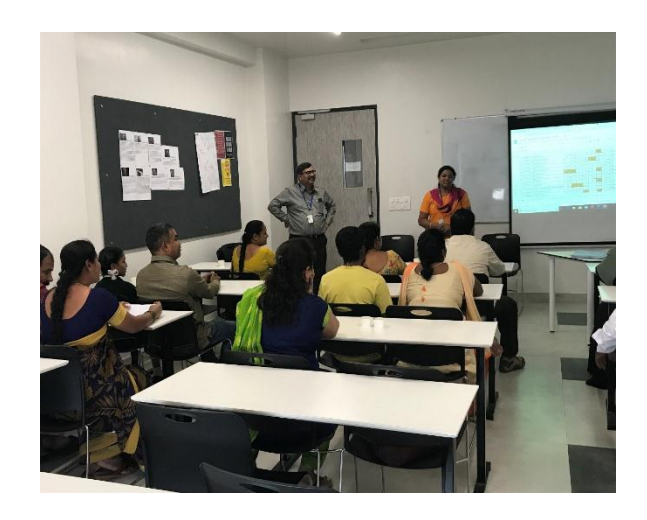
(PTM at the MBA meeting room)

The PTM was conducted on January 3, 2020: The following were the official proceedings of the meeting: